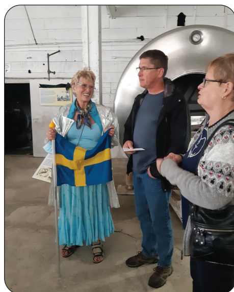
The Eriksdale Creamery Museum showcases the equipment formerly used to make butter in rural Manitoba.

Next, Eriksdale welcomed the Swedes, with the Swedish flag flying full out in the fall breezes. Deputy Reeve MacLennan brought greetings