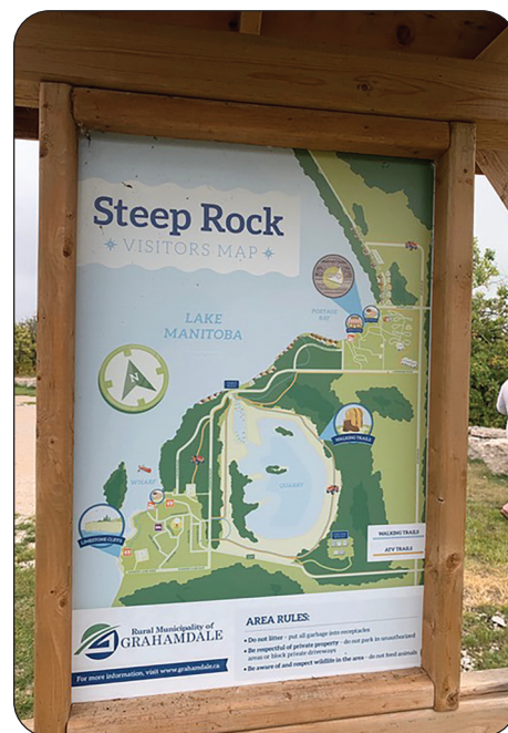
Steep Rock is free to visit and explore, and features numerous private beaches and caves.