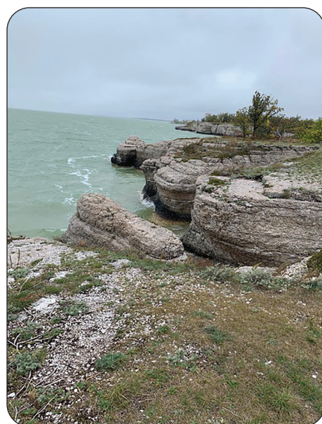
Located on the shores of Lake Manitoba, Steep Rock is known for its beautiful sunsets, rock formations and cliff-side views.